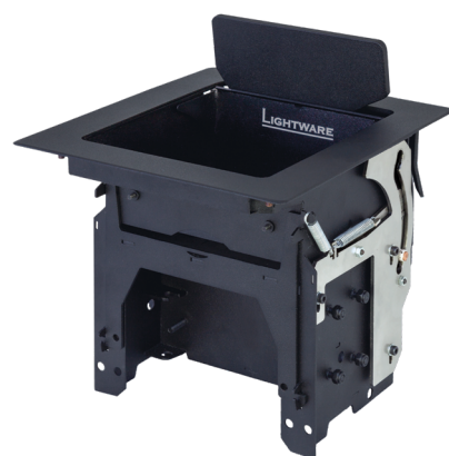
TBX-M220-K Table Box