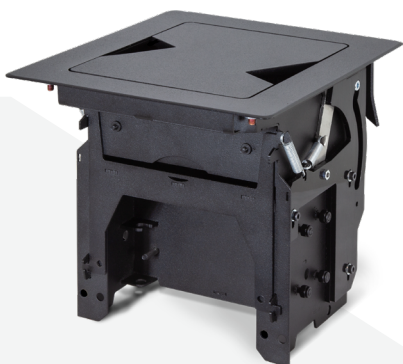
TBX-M210-K Table Box