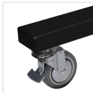
Includes non-marking 4" locking/braked castors