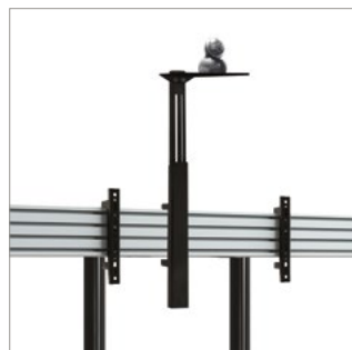
VC shelf can mount camera above or below the screens