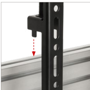
Simple 'hook-on' installation