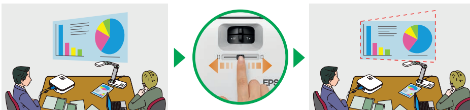
Horizontal Keystone Correction Adjuster: This intuitive new slider lets you adjust images to the correct shape when the projector is at an angle to the screen

Eliminate the need for photocopies: share 3D objects using the ELPDC06 visualiser