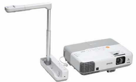
Share 3D objects using the ELP-DC06 document camera